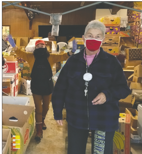
Food Boxes prepared for handout at the Brinnon Food Bank.

Thank you for your ongoing support of the Chamber and our Community