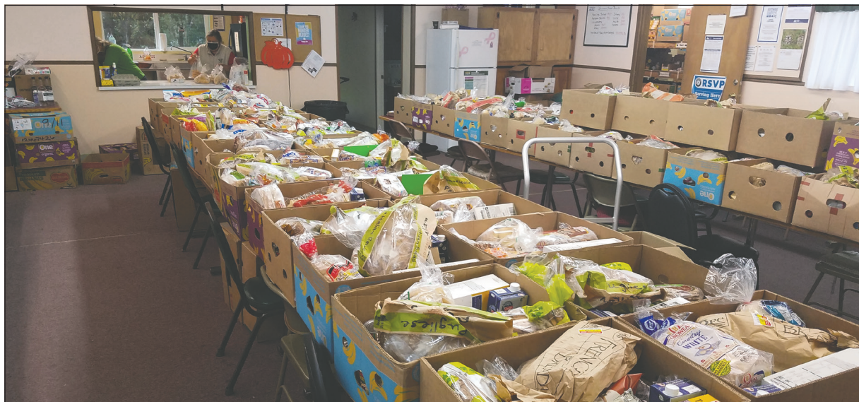
Food Boxes prepared for handout at the Brinnon Food Bank.